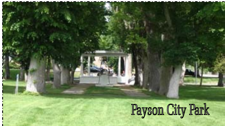
Payson City Park

So, welcome to Heritage Village Active Adult Community. We look forward to meeting you.